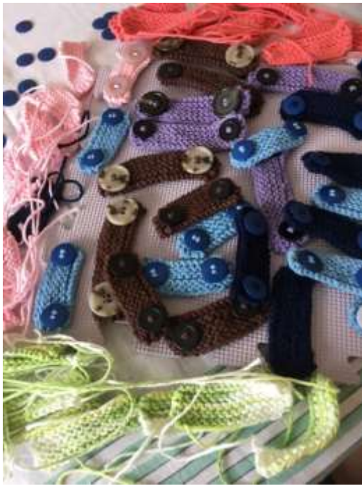
Linda Hill – Button bands for care workers to protect ears from masks