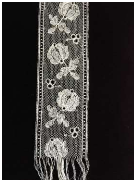
Sylvia Wright – Bucks Point Jewelry box cover insert