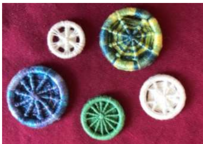
Variety of smaller buttons. Not perfect due to my centering issues! By altering how you lay spokes you can create other designs e.g. the snowflake at top left.