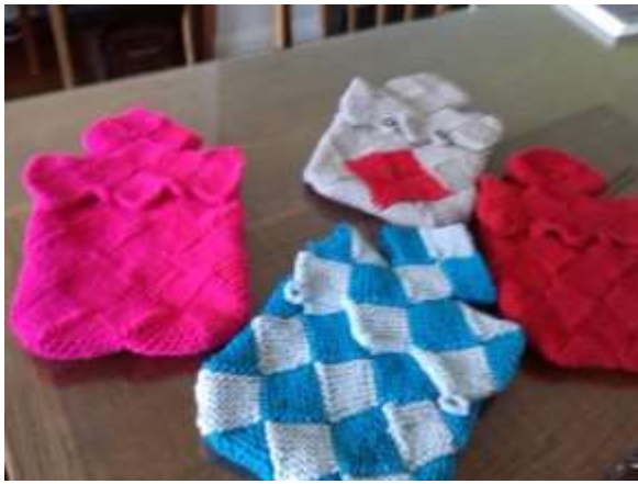
Ann Gunstone – Hot water bottle covers for Charity shop