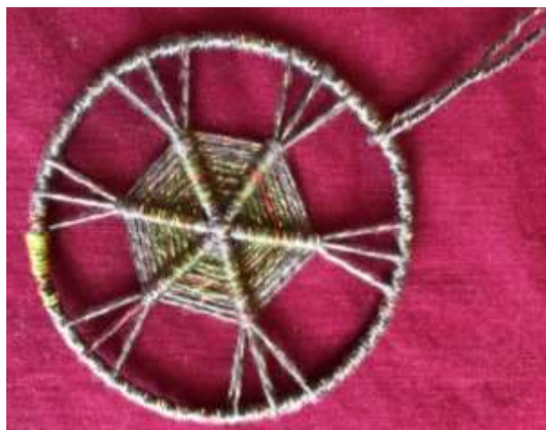
Using the snowflake design to create a Christmas decoration