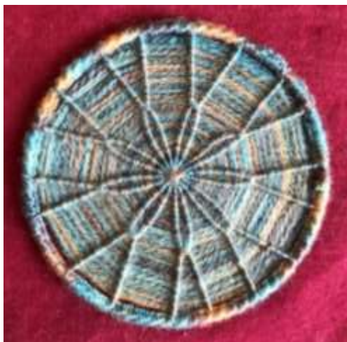
Daisy design on a bangle

There are all sorts of designs you can do and its fascinating seeing what other people are doing.